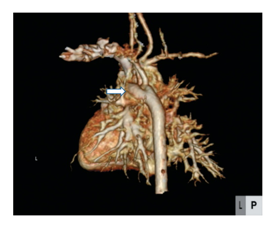
Figure 2 A preoperative CT image showing a large, patent ductus arteriosus (PDA). (the arrow indicates PDA).