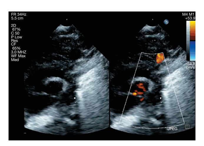
Figure 4 Preoperative echocardiography did not detect acceleration of flow within the preductal portion of the descending aorta.

(Figure 2). Prostaglandin was not administered. The aortic arch and the descending aorta had different diameters (Figure 3). The percutaneous SpO<sub>2</sub> measured at the feet