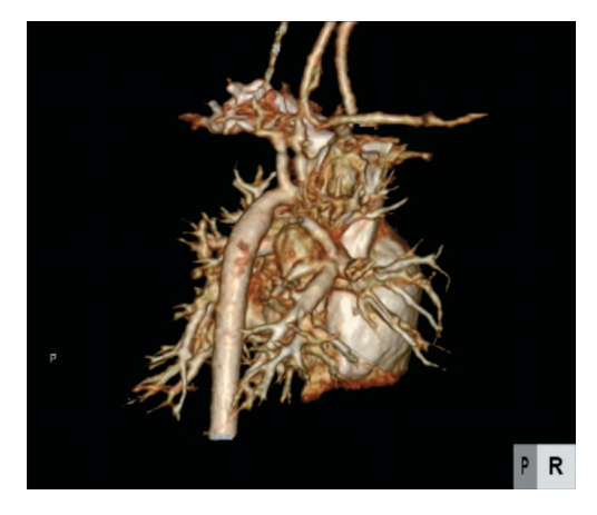
Figure 3 A preoperative CT image showing that the aortic arch and the descending aorta have different diameters.

(Figure 2). Prostaglandin was not administered. The aortic arch and the descending aorta had different diameters (Figure 3). The percutaneous SpO<sub>2</sub> measured at the feet